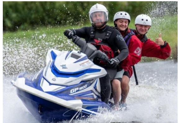
Just a taste of the fun activities our children enjoyed this summer