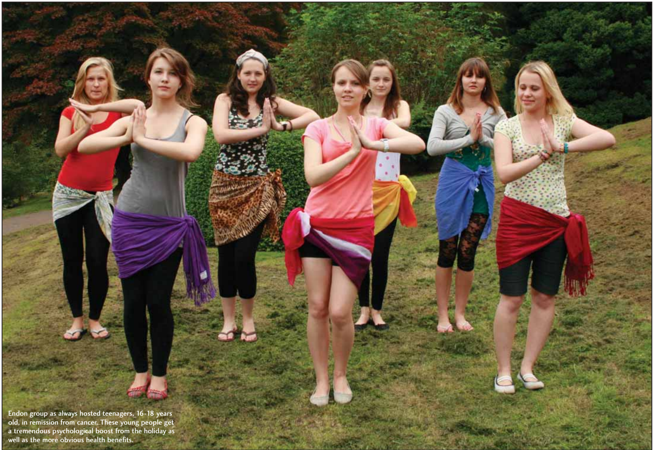
Endon group as always hosted teenagers, 16-18 years old, in remission from cancer. These young people get a tremendous psychological boost from the holiday as well as the more obvious health benefits.