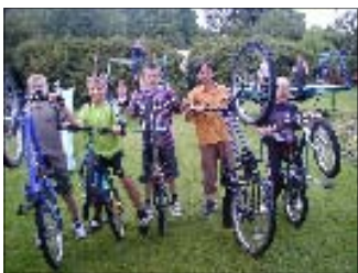
Happy kids with aid Bikes

Aid is received from many sources, companies and individuals who donate their surplus goods much of which is new and of excellent quality. This includes walking aid and wheelchairs for the disabled. We receive school equipment such as pens, paper, activity toys and lots of sports equipment, furniture such as chairs and tables. We are given early learning toys, art and craft materials, musical instruments and music centres. For the needy families, many living in poverty and with a disabled child, we send washing and cleaning materials, vitamins and medicines, good warm bedding and clothing, soap, shampoo, toothpaste and brushes, knitting and sewing machines, bicycles for children and adults, who walk miles to work each day and baby equipment including pampers. Good quality computers provide not only administrative tools for the institutions but learning and recreational activity for disabled children.