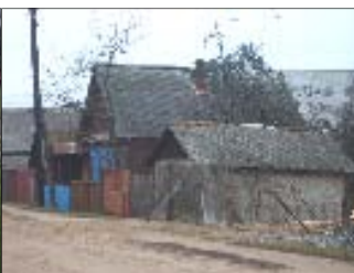
A typical village home