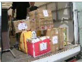
Goods arriving at Selby