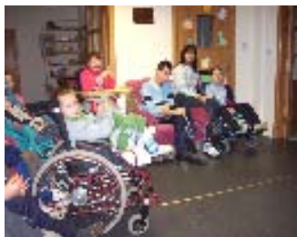
Children in our Mayflower Respite Centre

Since the Chernobyl explosion a large percentage of the annual national budget has been used to mitigate the effect of the radiation leaving very little to enhance the lives of the people and particularly that of disabled children. Many thousands of the country people were moved into high rise flats in the cities and their village homes demolished. Improvements to buildings, schools and facilities are progressing particularly in the towns and cities. However for many Belarusians, particularly those with sick or disabled children, poverty and illness are a way of life. Our aid deliveries create immediate support and hope to these families and encouragement to the communities for them to make improvements to their local circumstances by their own endeavours.